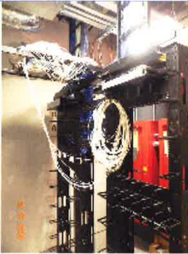
1st Floor IT Room