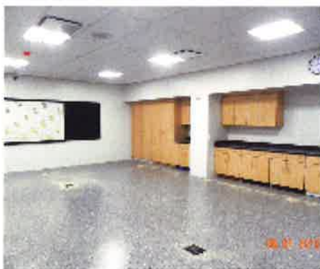
First Floor Classroom