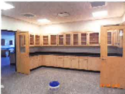
Science Prep Room