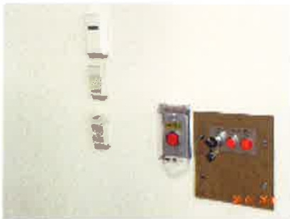
Second Floor Lab Purge and Gas Shutoff