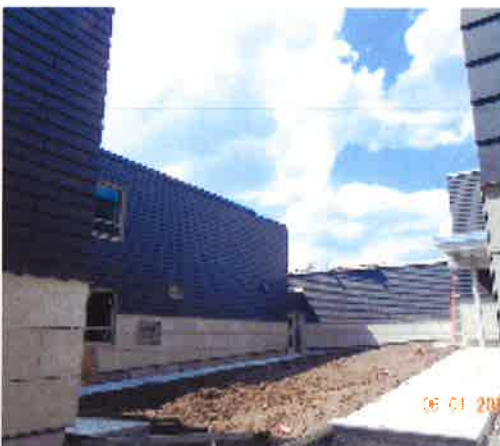
Exterior—Near Upper Gym Courtyard