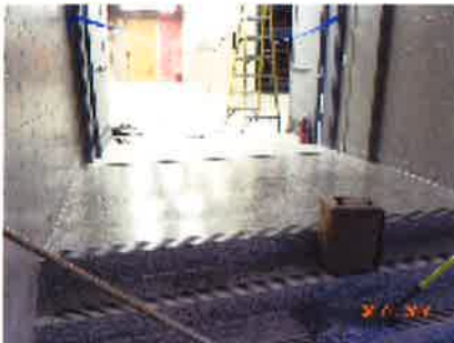
Unit I Ramp at Stairwell

HVAC Contractor performed the following: Continue coordination with GC, EC & PC Continued Daily Clean-up Continued Demolition – Existing Boiler Room Completed Fume Hood Ductwork Final Connections Completed Basement F Demo and Wall Patching Completed Area I Startup (RTU's, VHP's & HHP's)