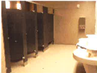
First Floor Plumbing