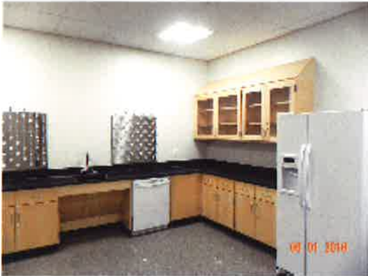
2nd Floor Science Prep Room