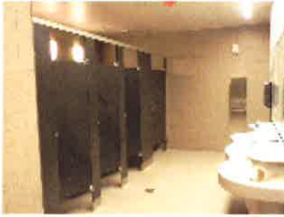
Second Floor Restroom