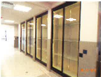
Second Floor—Unit I Corridor

Abatement Contractor: Demolition of the existing boilers is complete.