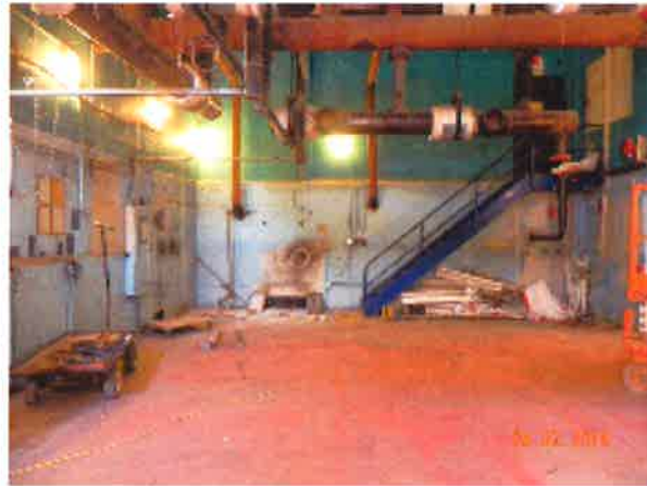
Boiler Demolition Complete