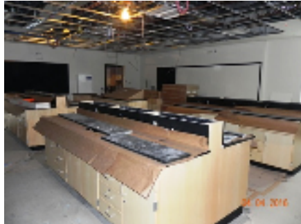
Second Floor Lab