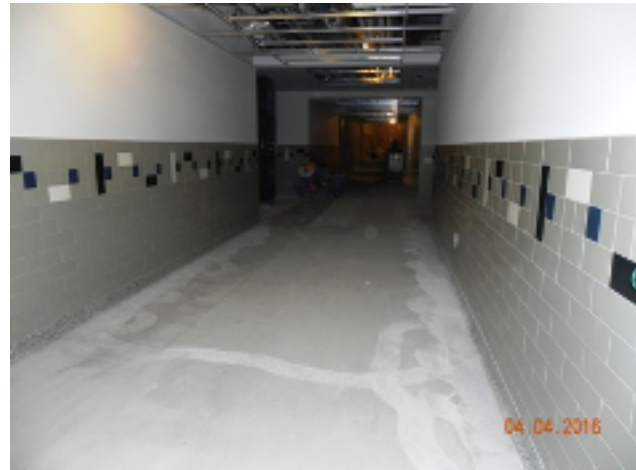
1st Floor Corridor