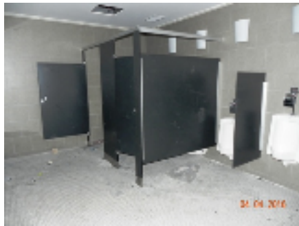
First Floor Plumbing Rough In