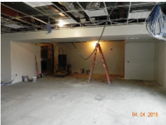
First Floor Classroom