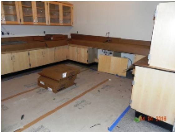
2nd Floor Science Prep Room