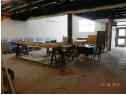
Unit I Locker Lobby