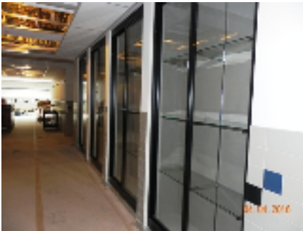
Second Floor—Unit I Corridor