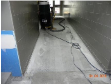
Unit I Ramp at Stairwell

The Electrical Contractor performed the following: