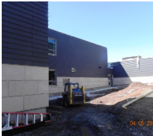
Exterior—Upper Gym Courtyard