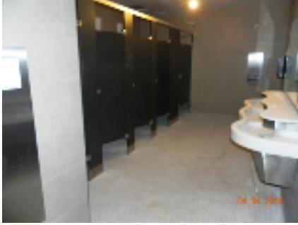
Second Floor Restroom