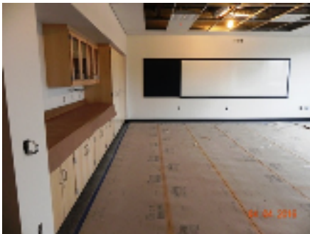
Second Floor Unit I Classroom