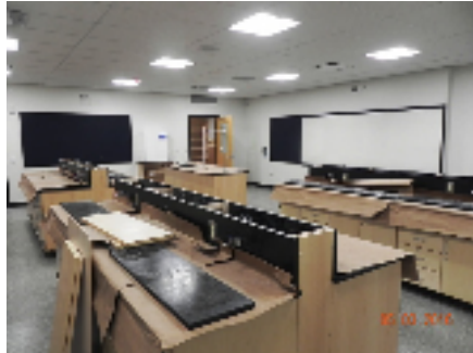
Second Floor Lab