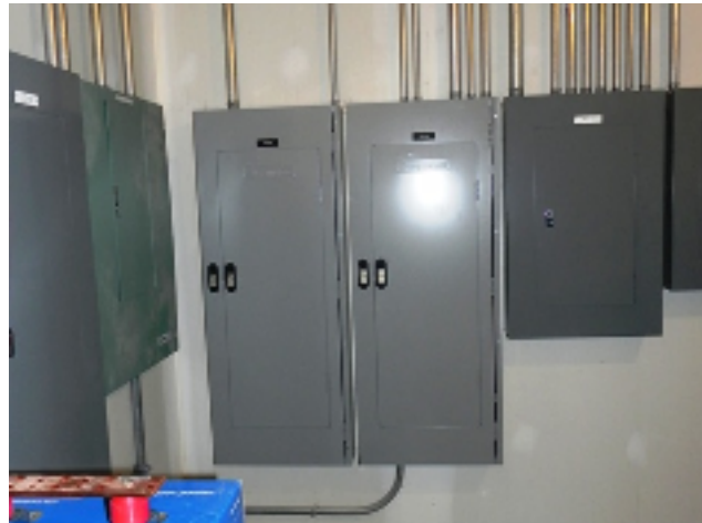
1st Floor Electrical Room