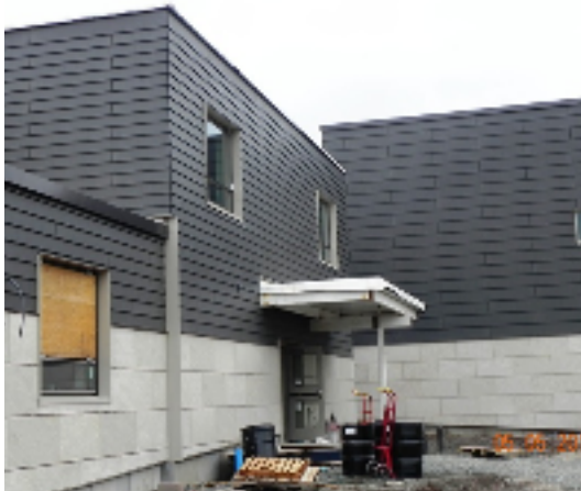
Exterior—Near Upper Gym Courtyard