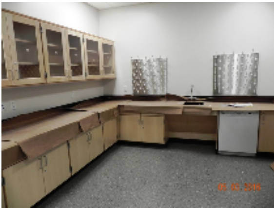
2nd Floor Science Prep Room