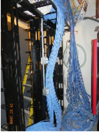
1st Floor IT Room