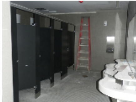
First Floor Plumbing