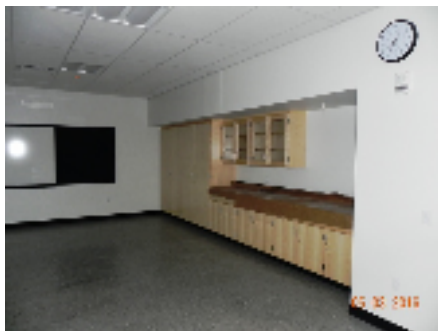
Second Floor Unit I Classroom