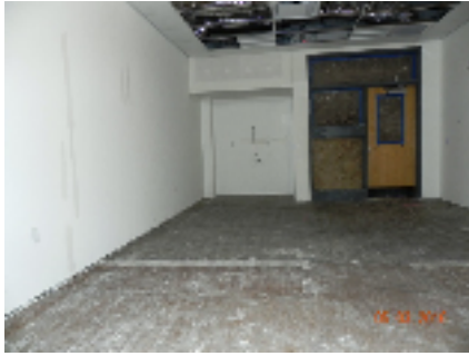
Instructional Planning Center (IPC)