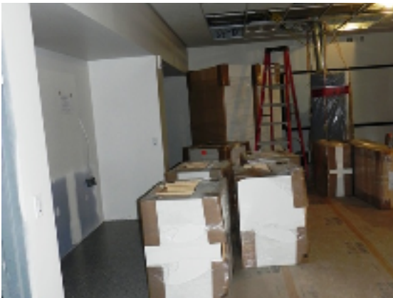
First Floor Classroom