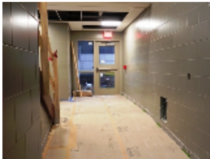
Unit I Ramp at Stairwell

HVAC Contractor performed the following: Continue coordination with GC, EC & PC Continued Daily Clean-up Received – Area I Dryer Booster Fan Misc. Wall Patching Rough In Electric Wall Heaters