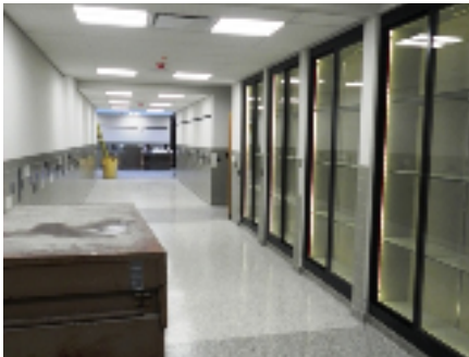
Second Floor—Unit I Corridor

Abatement Contractor: Next planned activity is in the Phase 3B and 4