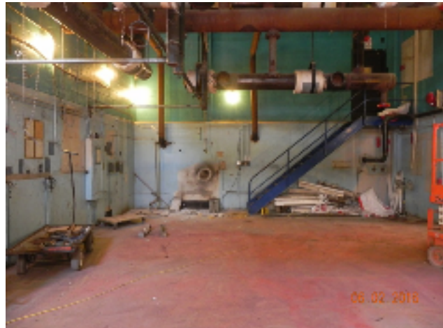
Boiler Demolition Complete