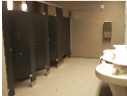
First Floor Plumbing