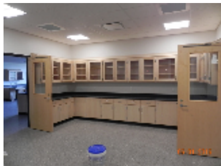
Science Prep Room