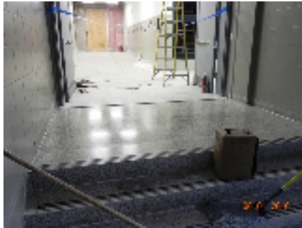
Unit I Ramp at Stairwell

HVAC Contractor performed the following: Continue coordination with GC, EC & PC Continued Daily Clean-up Continued Demolition – Existing Boiler Room Completed Fume Hood Ductwork Final Connections Completed Basement F Demo and Wall Patching Completed Area I Startup (RTU's, VHP's & HHP's)