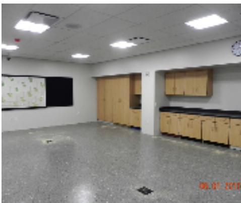
First Floor Classroom