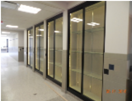
Second Floor—Unit I Corridor

Abatement Contactor: Demolition of the existing boilers is complete.