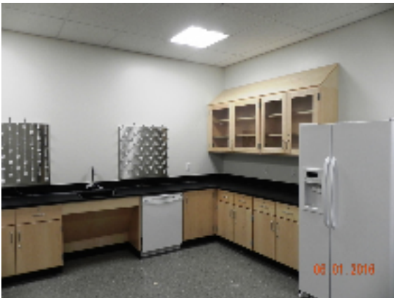
2nd Floor Science Prep Room