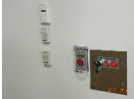
Second Floor Lab Purge and Gas Shutoff