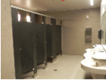
Second Floor Restroom