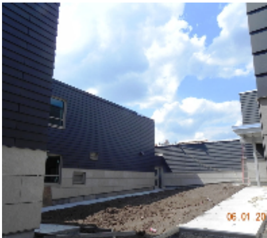
Exterior—Near Upper Gym Courtyard