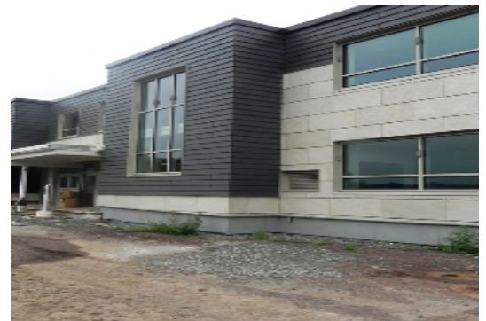
Unit I -Stairs