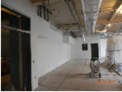
Art Room Looking at Kiln Room