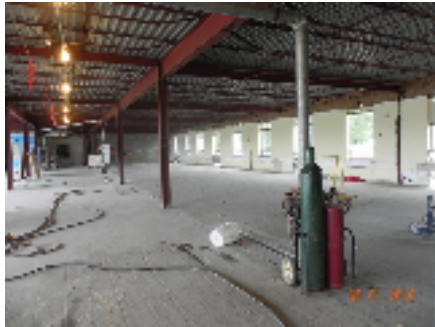
Unit J—2nd Floor