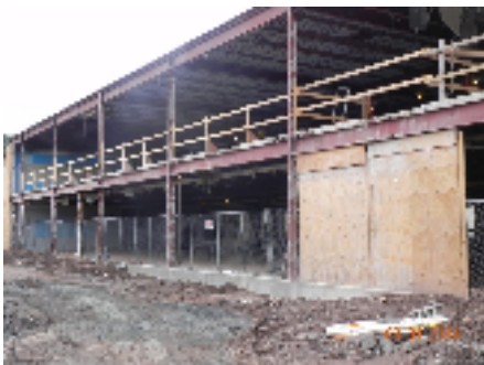
South Side Exterior Unit J