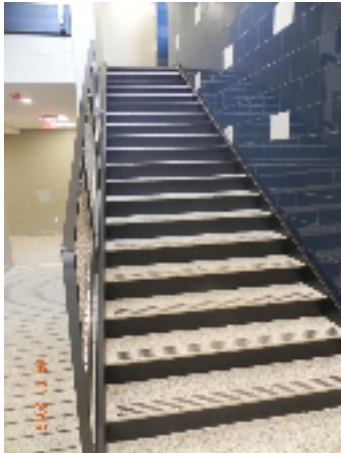
Unit I -Stairs