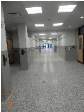
1st Floor Unit i -Corridor