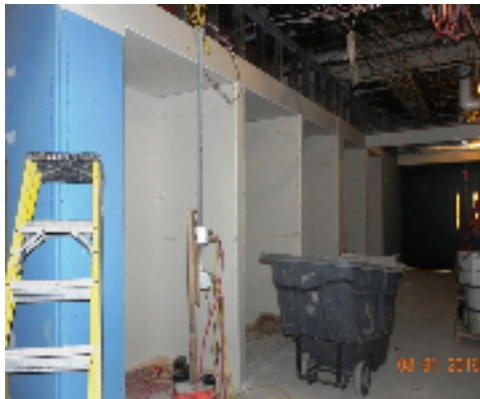
Display Cases At Art Rooms