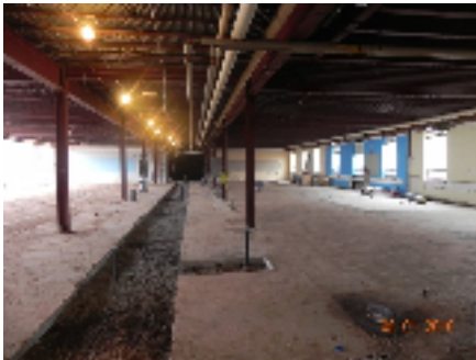
Unit J—1st Floor