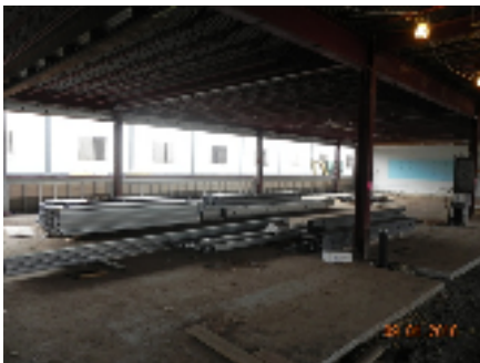
Unit J—1st Floor South Wall Framing