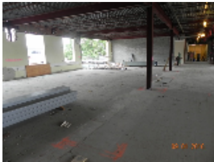
Unit J—2nd Floor Demo Started