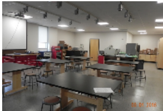
Tech Ed (Temp Location)