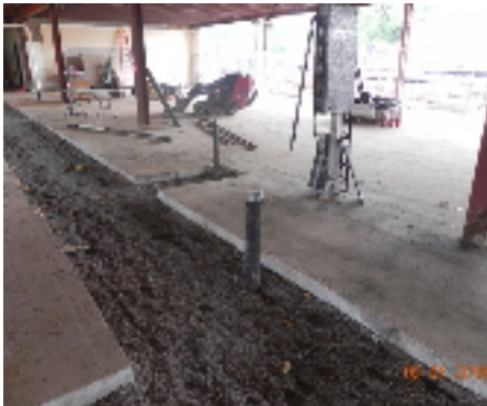
Unit J—1st Floor North Wall