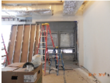
Art Room Mechanical Closet