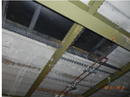
Dance Studio Rooftop Unit Curb and Rough-In