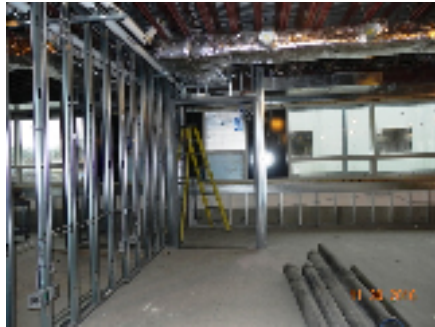
Unit J 1st Floor South Side