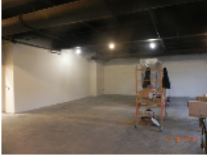
Tech Ed (Boiler Room)