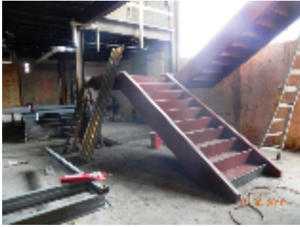
New Stairs Old District Office