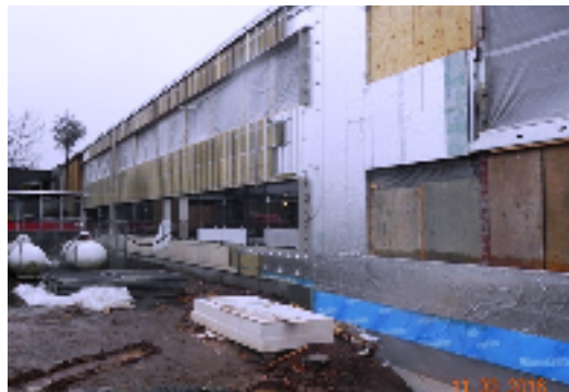
Exterior North Wall Unit J