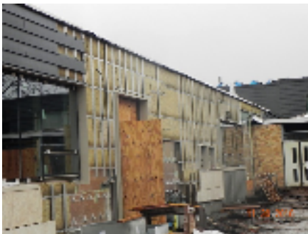
Coiling Door and Corner of Walkway

HVAC Contractor performed the following: Continue coordination with GC, EC & PC Continued Daily Clean-up Continued Pipe Hanger Installation – Unit J Level 2 Continued Pipe Installation – Unit J – Level 1 Continued Unit J – Level 2 Duct Hanger Installation Continued Unit J – Level 2 Duct Installation Continued Unit J Level 1 & 2 HVAC Equipment Installation Continued Unit J – Level 1 & 2 Misc. Demo Tasks Continued Unit J – Level 1 Duct Fabrication Completed installation of TE Engineering Ductwork Installed Tech Ed HHP(V) FB-1 O/A duct installation up through roof.