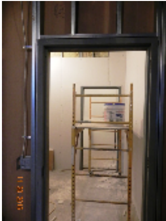
Electrical and IT Rooms First Floor