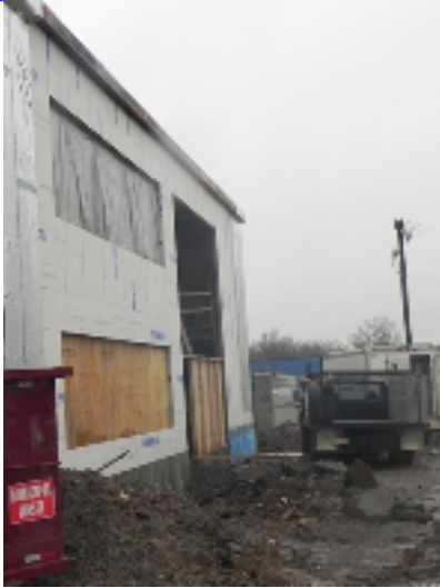
Exterior West Wall Old District Office