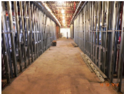
Unit J—2nd Floor Corridor

Plumbing Contractor performed the following: Completed Rough In Second Floor Unit J Continued installing roof drains and rain water as available Unit J-2 coordinating with Roofer Continued with compressed air rough-in Tech Ed