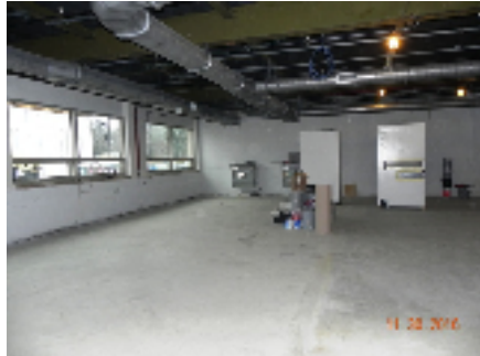
Tech Ed Painting In Progress