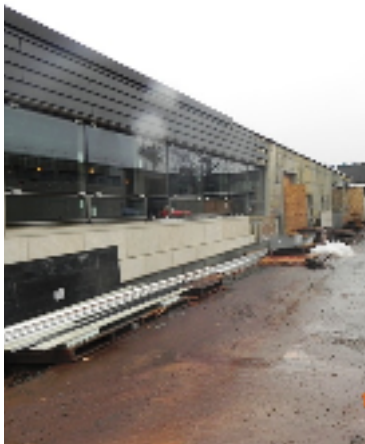
Exterior South Wall - Tech Ed