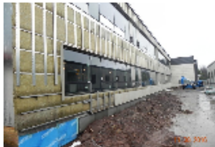
Exterior South Wall Unit J