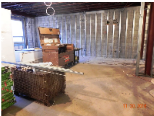
Unit J 1st Floor West Wall